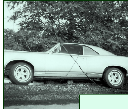
'67 GTO vs. ditch and power lines