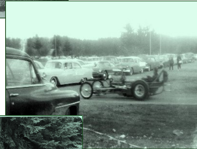
Dragster at SIR around 1966