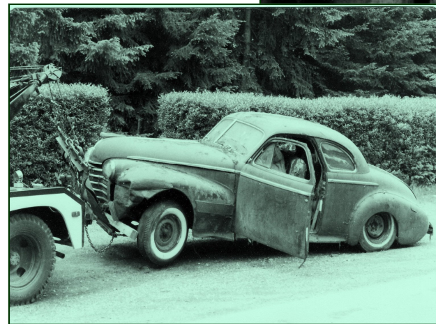
1940 Olds "on the hook"